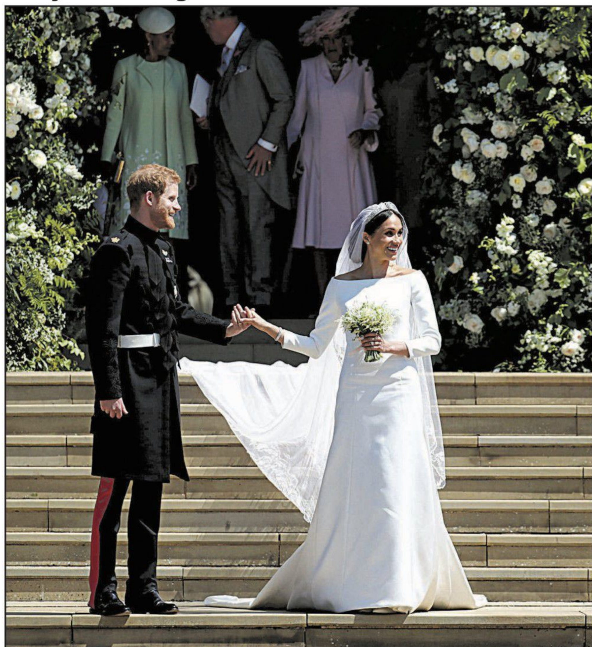
Britain’s Prince Harry and bride Meghan Markle, her long train flowing over the steps, stand outside St. George’s Chapel at Windsor Castle after they were married Saturday in front of hundreds of royal and celebrity attendees and millions of TV viewers.