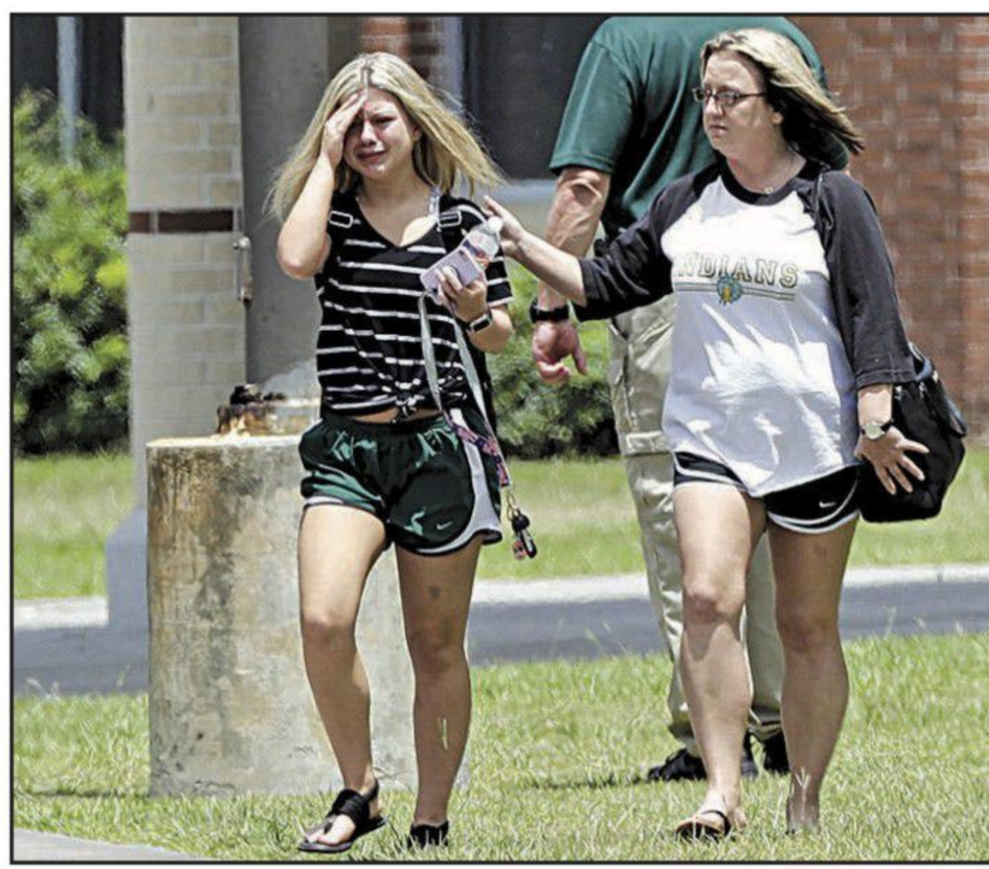
A student (left) leaves Santa Fe High School on Saturday after retrieving belongings left behind Friday during a shooting at the school in Santa Fe, Texas, that left 10 people dead.