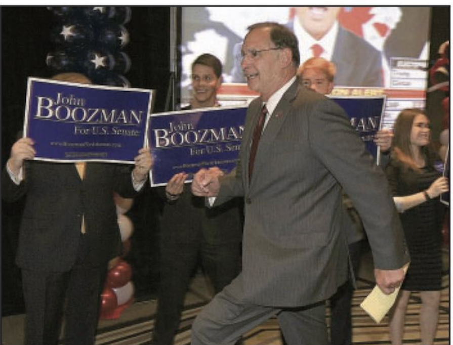
Sen. John Boozman celebrates his re-election Tuesday night at a Republican watch party in Little Rock.

In the March 1 primary, he defeated Republican businessman Curtis Coleman of Little Rock.