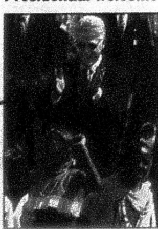
President Clinton joins the celebration Tuesday as Ugandan children welcome him to the Kisowers School in the village of Mukono. Clinton promised new friendship and help for Africa. Article, 7A