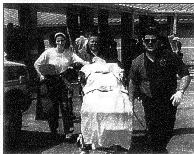
Emergency workers rush an injured student to an ambulance Tuesday at Westside Middle School near Jonesboro, where authorities said as many as 27 shots were fired at children and teachers outside because a fire alarm had sounded.