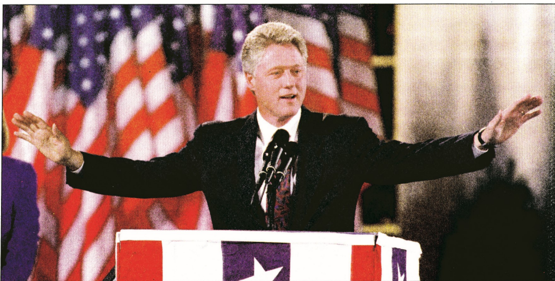
Bill Clinton waves to crowd during his victory speech Tuesday night at the Old State House in Little Rock