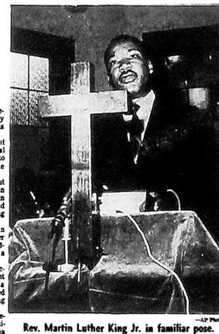
Rev. Martin Luther King Jr. in familiar pose.